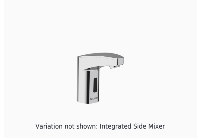
Variation not shown: Integrated Side Mixer